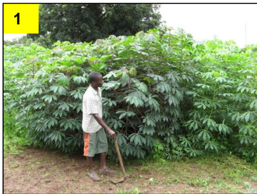
A garden of the new Cassava varieties can guarantee food security in case Maize fails due to drought or can provide a source of food when Maize is scarce between November and April .

Conservation Agriculture Programme Supported by Norwegian Government