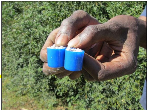
Fertilising: If you sprinkle 2 Cups of D around the base of each plant in January or early February, the Cassava will benefit greatly. For a garden of 20m x 20m containing 400 plants, this is only 7kgs of D.