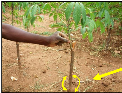
Weeding: Keep young plants free of weeds until the weeds are smothered by the mature plants. Cassava planted like this will produce 1 or 2 shoots which then branch out later.