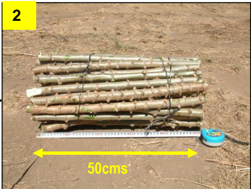
For food between December and March , a garden of 20m x 20m is sufficient for most families. This will require 4 bundles of 100 cuttings, 50cms long or 400 cuttings.

Make sure you plant the correct varieties for your area Where Cassava is commonly grown:- Bangwueulu Bitter Chila Semi Bitter Or any of the varieties below:- Where Cassava is not commonly grown, only:- Nalumino Semi-Sweet Mweru Semi-Sweet Kapolombo Sweet Tanganyika Very Sweet