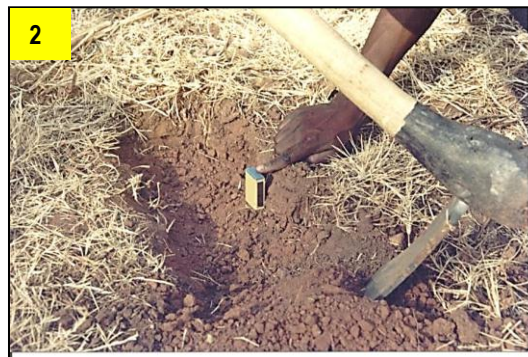
2 Check Backfilling: If you have backfilled basins properly there should be a small hollow with some extra soil left to cover seeds at planting time.