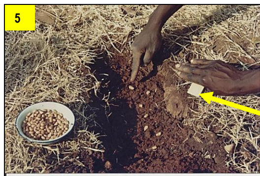
5 Planting Groundnuts: Plant 8 to 10 seeds across the basins the day after first big rain after finishing Maize planting. Finish the same day. Cover with 5cms of soil.

Observe the visible part of the matchbox in the farmers hand for practical guide on correct planting depth.