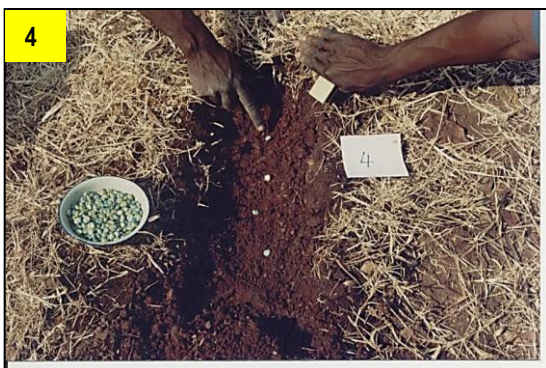
4 Planting Maize: Plant 4 seeds across the basins the day after the first big rain that falls after November 15 th . Finish the same day. Cover with 5cms of soil.