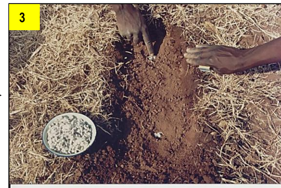
3 Planting Cotton: Fill basin level. Dry plant cotton anytime after 8 th November. Soil must be dry. Or plant immediately after first heavy rains. Squeeze small pinch of seed into soil at both ends of basin. Seed should remain visible.