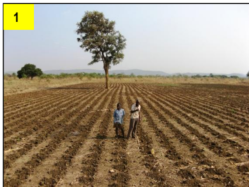
1 Finish Land Prep Before Rains: Being ready to plant immediately after the first heavy rains is the key to high yields.

Conservation Agriculture Programme Supported by Norwegian Government