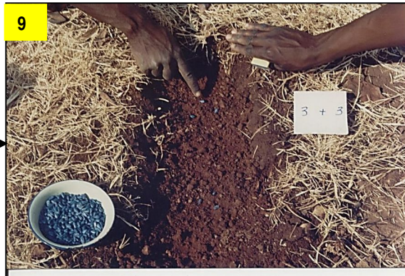
Planting Sunflower: Plant 2 to 3 seeds at both ends of the basin in mid December and finish the same day. Cover with 2.0cms of soil. Do not plant deep or plants will not emerge.