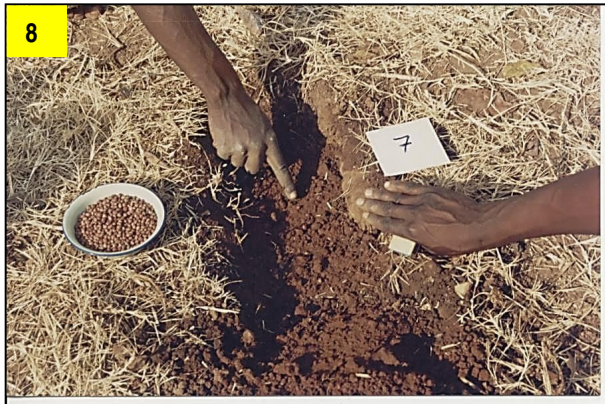
Planting Cowpea: Plant 7 to 8 seeds across the basins in mid December the day after heavy rain and finish the same day. Cover with 2.5cms of soil.