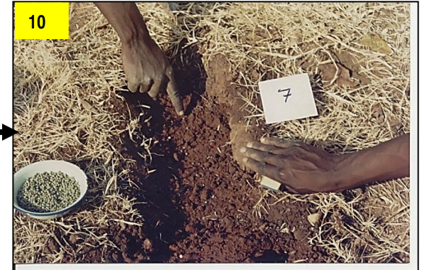
Planting Green Gram: Plant 7 to 8 seeds across the basins in mid December the day after heavy rain and finish the same day. Cover with 2.0cms of soil.

Always finish planting the same day when the soil is moist enough to achieve rapid germination and emergence. Never plant into hot drying soil. If it doesn't rain for some days the seeds will rot.