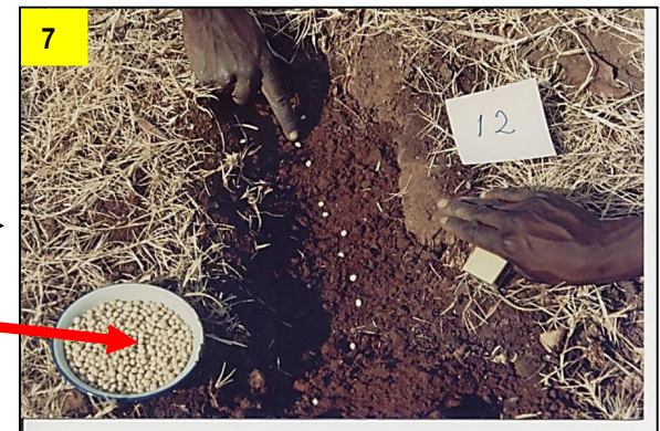
Planting Soya Beans Plant 10 to 12 seeds across the basins. Plant in early December the day after heavy rains and finish the same day. Cover with 3cms of soil.