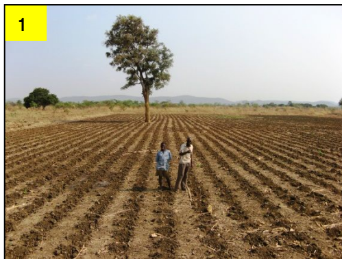
1 Finish Land Prep Before Rains: Being ready to plant immediately after the first heavy rains is the key to high yields.