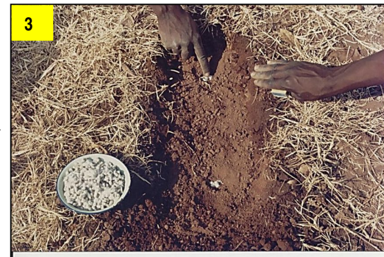
3 Planting Cotton: Fill basin level. Dry plant cotton anytime after 8 th November . Soil must be dry. Or plant immediately after first heavy rains. Squeeze small pinch of seed into soil at both ends of basin. Seed should remain visible.