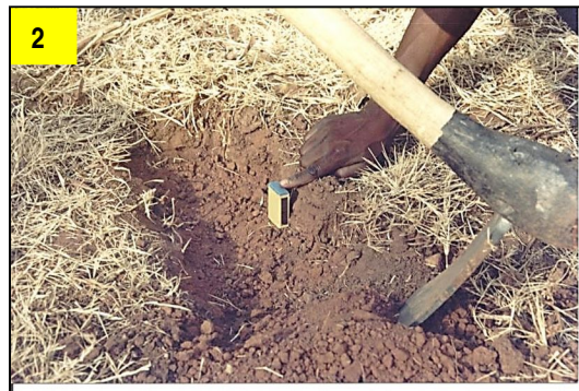
2 Check Backfilling: If you have backfilled basins properly there should be a small hollow with some extra soil left to cover seeds at planting time.