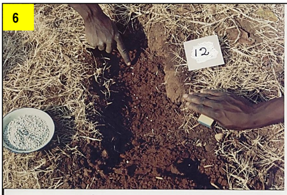
Planting Sorghum: Plant 10 to 12 seeds across the basins the day after first big rain or after next big rain after finishing Maize planting. Cover with 3cms of soil.