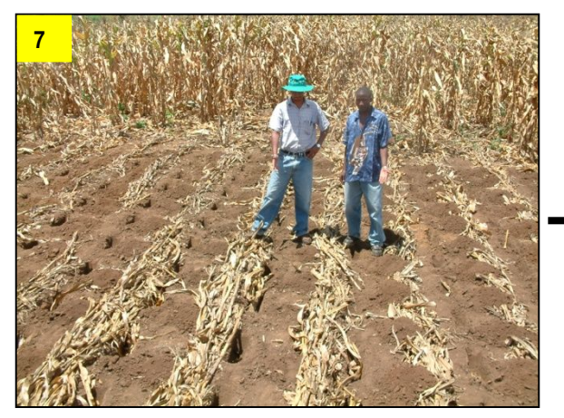
Early Land Preparation: Start as early as possible in season. Work for 2 hours each morning only. Make sure whole family knows the job.