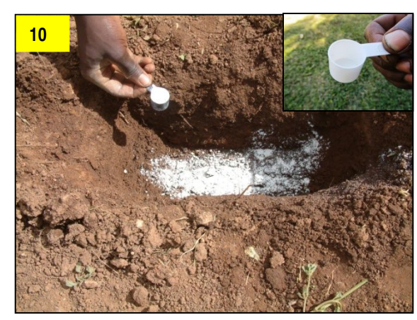
Liming: If you have grown Maize for many years your soils will be <u>acid</u>. Apply 1 cup of lime with the basal. Always use the No 8 white cup. This is 4bags/ha. Read CF Handbooks about liming.