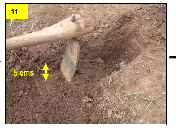
Backfilling Basins: Backfill basins with hoe blade leaving only small hollow about 5cms deep.