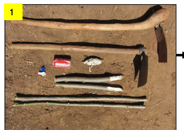
Equipment Needed: Chaka hoe, or strong weeding hoe with <u>narrow</u> blade, blue and white fertiliser cups, Teren rope, 90cm row sticks, pegs.